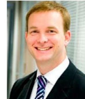
Owner/Manager at HR Consult

As he dispenses these nuggets of wisdom, you can't help thinking that there is something incongruous at play. And then you spot it. His youthful visage belies the lengthy road he has already travelled while serving his time in