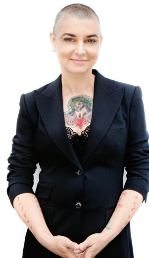
SINÉAD O'CONNOR WEARS Tailored black wool jacket (€885) by Dolce & Gabbana @ Brown Thomas